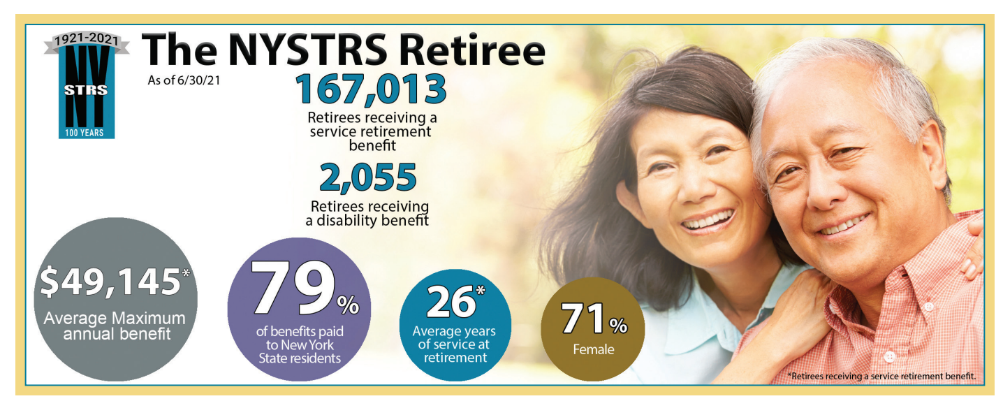
Graphic from 2021 Popular Annual Financial Report

The 2021 PAFR is available on the Annual Reports page at NYSTRS.org. To request a print version, call our Hotline at (800) 782-0289. For more detailed financial information, see our Comprehensive Annual Financial Report , also available at NYSTRS.org.